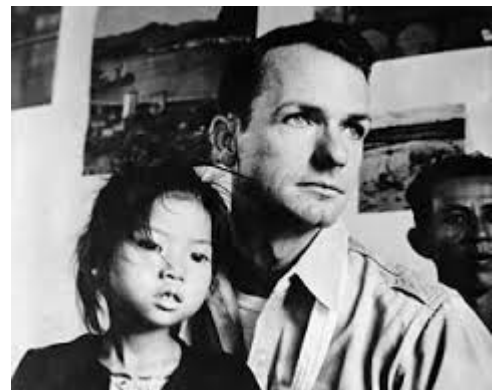
Dr. Thomas A Dooley with one of his first patients in Viet Nam.

For a full history of the Dr. Thomas A Dooley Assembly, visit our web site at http://drdooleyassembly.com